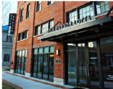
LUXURY LOFT LIVING